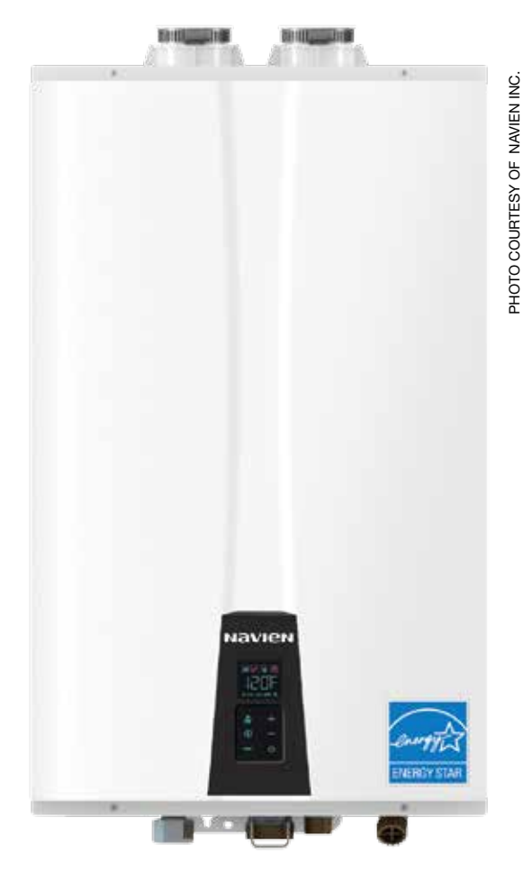
Navien Inc.'s tankless water heaters offer reliable, space-saving design and flexibility. They are compact and can be mounted on a wall, taking up less space than conventional storage water heaters.

warranties than conventional water heaters. Like all equipment, they should be maintained and supplied with acceptable water quality and have regularly scheduled or required service," Fenske said.