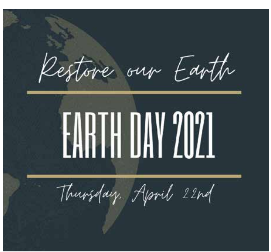
The theme of this year's Earth Day, which takes place April 22, is "Restore the Earth." Clean-burning natural gas plays a significant role in helping to preserve the environment.

The U.S. Department of Energy analyses indicates that every 10,000 U.S. homes powered with