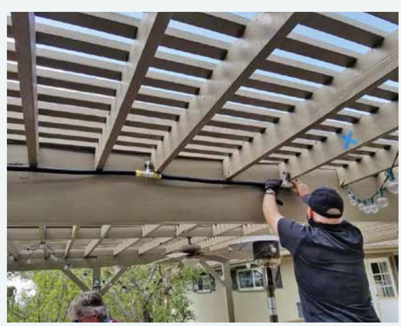
Corrugated Stainless Steel Tubing, or CSST, is an ideal match for outdoor rooms because its flexibility allows it to be installed in a variety of configurations to meet design needs.

"CSST allows you to create an infrastructure that is easy to install, is low maintenance and can give you flexibility," he said. "Depending on how big your outdoor use is going to be, you can set up as simple or as complex an arrangement as you need with relatively low cost and fast installation. I see CSST and outdoor lifestyles as a great partnership with consumer features, smart technologies and innovative, adaptable piping systems."